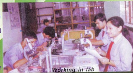
Working in lab

A science laboratory with necessary equipments and materials is available for all the level of students. The students can be involved in all possible practical works.