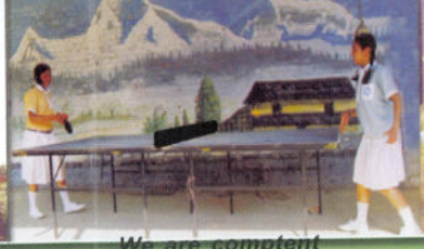
We are competent